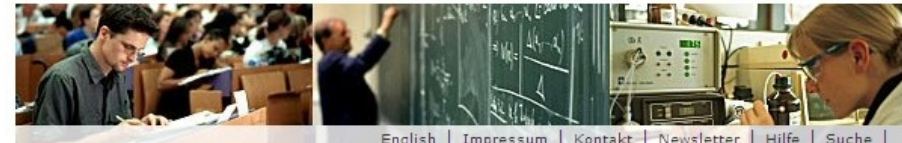
English | Impressum | Kontakt | Newsletter | Hilfe | Suche

Internationale Kooperationsvereinbarungen deutscher Hochschulen.