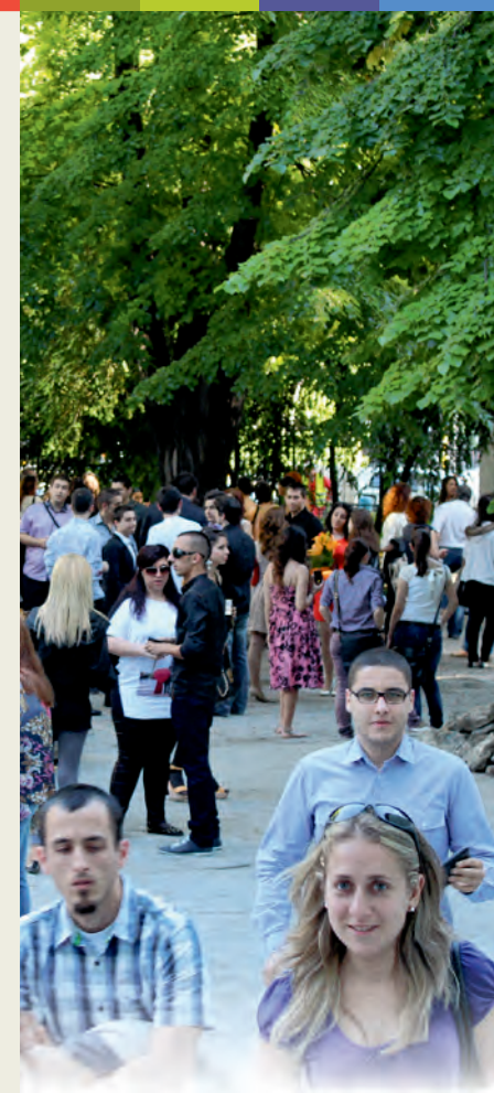
Link to the official website of the UE - Varna www.ue-varna.bg

After acquiring the educational and qualification degree of Bachelor in Business Economics students can continue their education to a master's degree and doctoral studies in this country and abroad.