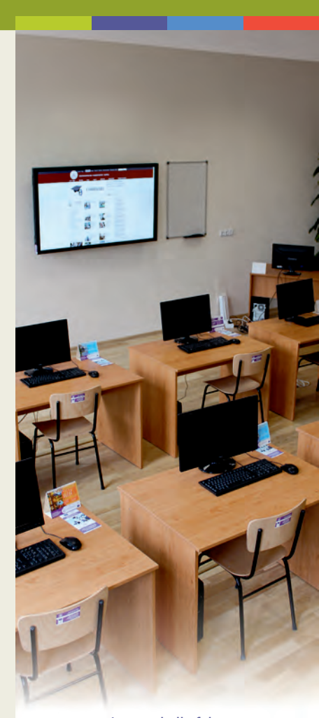
Lecture hall of the University of Economics - Varna